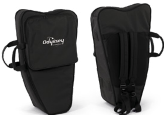
Transport cover wear it like a rucksack!